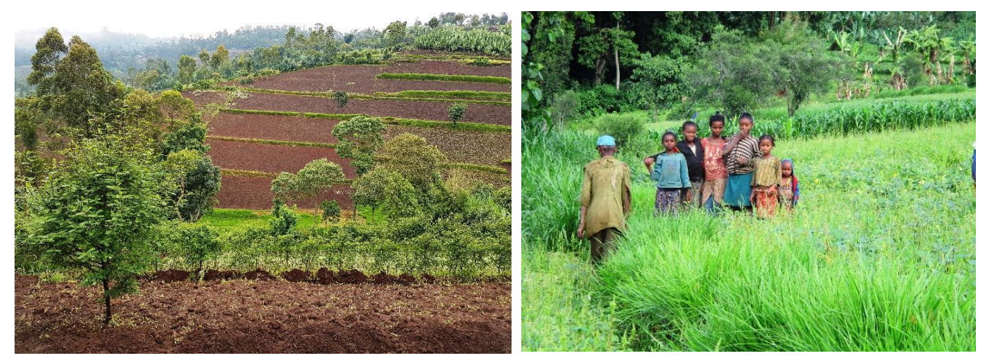
Left: landscape of Kacha Bira Woreda (Kembata-Tembaro Zone) // Right: anti-erosive structure planted with Pennisetum riparium in Boloso Sore Woreda (Wolayta)

Moreover, these fodder grass productions have a good financial value on the local market, at any given time of the year. Their maintenance requires relatively limited amounts of work, and they also have the advantage of being harvestable in batches rather than all in one go, depending on the needs and availability of the farmer. Cropping fodder grasses is therefore compatible with traditional farming activities. Another important advantage of these fodder grasses is that farmers can sell them either directly in the fields or at the local market, which is particularly interesting for more vulnerable families who have no animals and have only limited workforce.