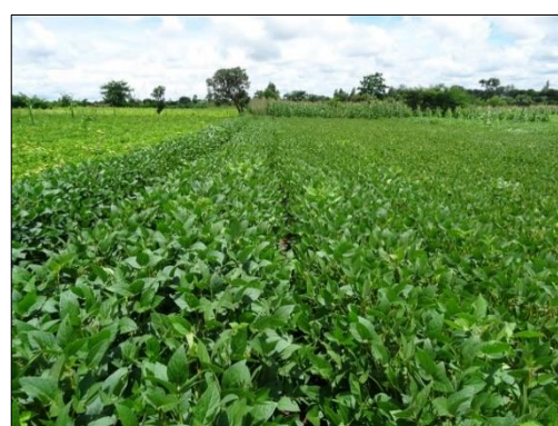
Soybean cultivated in double row system (Inter Aide 2019)

For most of the groundnut varieties, planting stations are normally spaced at 15cm apart on each row. The seed itself is buried at a depth range of 5 to 6cm. With ridges spaced 75cm apart, 120 kg of seeds are required for a population of 179,000 plants per hectare, while with 90cm ridges only 100 kg of seeds will be needed for a population of 148,000 plants per hectare. Here also, there will be the need of 20% more seeds.