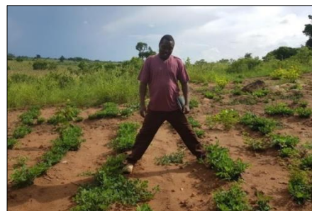
An extension worker showing the huge loss of cultivable surface induced by the single row planting system with 90cm ridges for groundnut cultivation (ICRISAT) 2019).

Inter Aide had previously promoted most of the crucial aspects allowing to improve soybean and groundnut production (use of productive varieties such as CG-7 for groundnut and the self-inoculated Tikolore for soybean, early planting, weed control and use of compost). For soybean, access to inoculant is difficult and farmers reported during different trials in 2016 and 2017 that the process of inoculation was cumbersome and did not give positive results. Inter Aide decided not to work anymore with varieties that require inoculant and continued therefore to promote the Tikolore 2 variety that does not require inoculation. As Inter Aide approach is focusing on low-cost technologies for economically-constrained rural households, testing the planting in double-row system and the reduction of ridges to 90cm to 75cm were logically the only main remaining factors that could make an additional difference when it comes to soybean and groundnuts production. As a reminder, shifting ridges from 90cm to 75cm apart increase by 18% the agricultural productive surface (as 10 meters of land can contain 11 ridges at 90cm and 13 ridges at 75cm). As yields reported on research stations are often higher than on farm due to better soil fertility and crop management (Van Vugt, 2018) and because the relevance of technologies varies according to different local contexts and factors, Inter Aide conducted some on-farm trials and surveys to assess the relevance of promoting this technology.